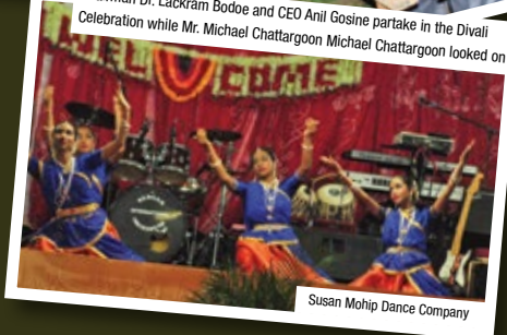
Susan Mohip Dance Company