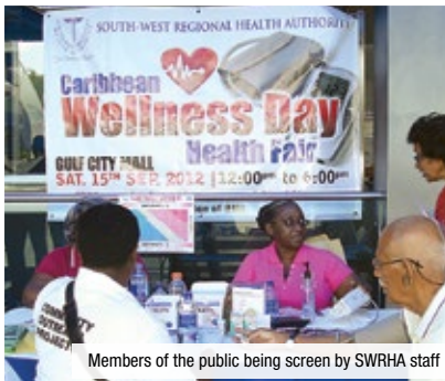
Members of the public being screen by SWRHA staff

Caribbean Wellness Month was celebrated in September and the Nutrition and Dietetics department of the South-West Regional Health Authority was on hand to service the multitude of shoppers in Gulf City Mall La Romaine on Saturday 15th September, 2012.